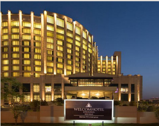
Delhi ITC Dwarka