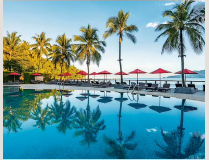
Phuket Amari Phuket