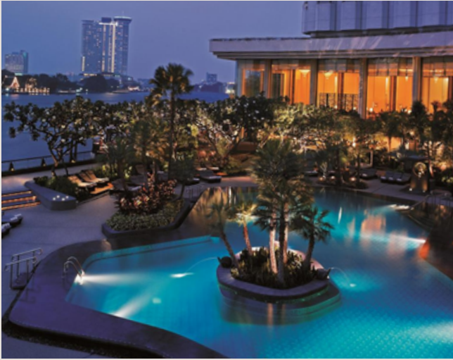
Bangkok Shangri La Hotel