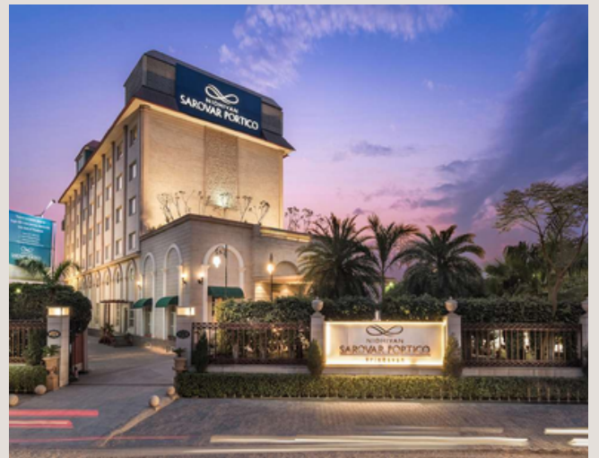
Mathura Nidhivan Sarovar